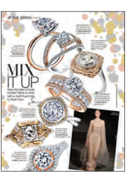
All That Glitters

Where and How to Get Married in Worldwide Destinations